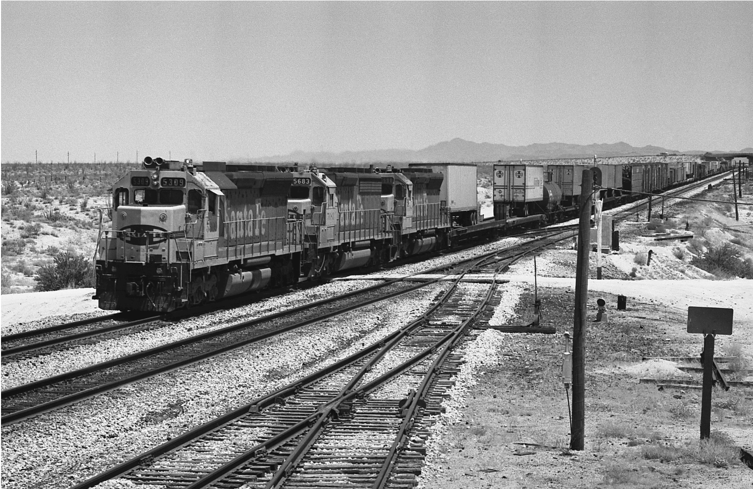
Two versions of the SD45 drop westbound toward the Colorado River at Yucca, Arizona, 1983.

A morning eastbound ascends Cajon Pass at Devore with an SD45B between the F45 and GP40X, 1987.