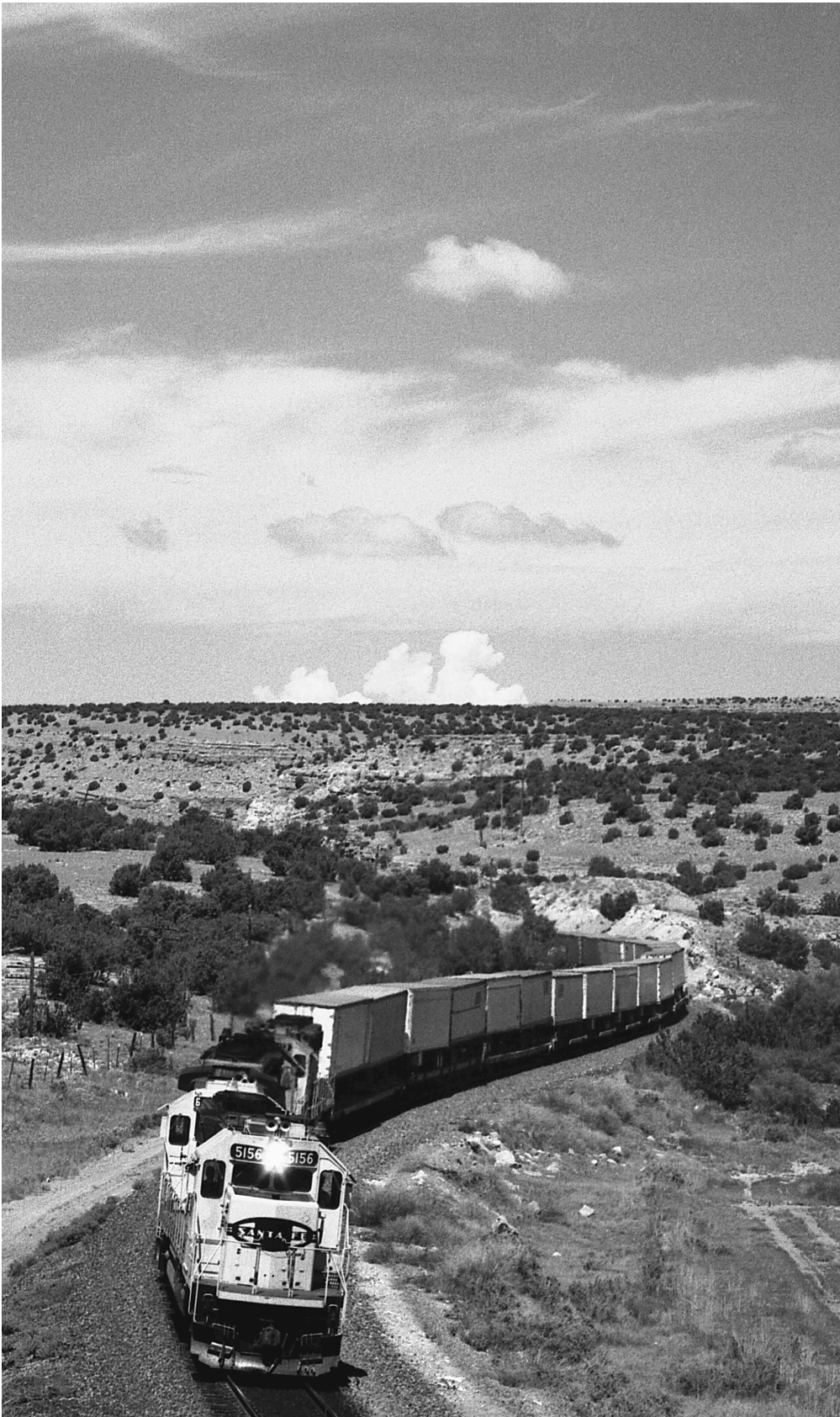
An eastbound climbs out of the eastern end of Abo Canyon, 1988.