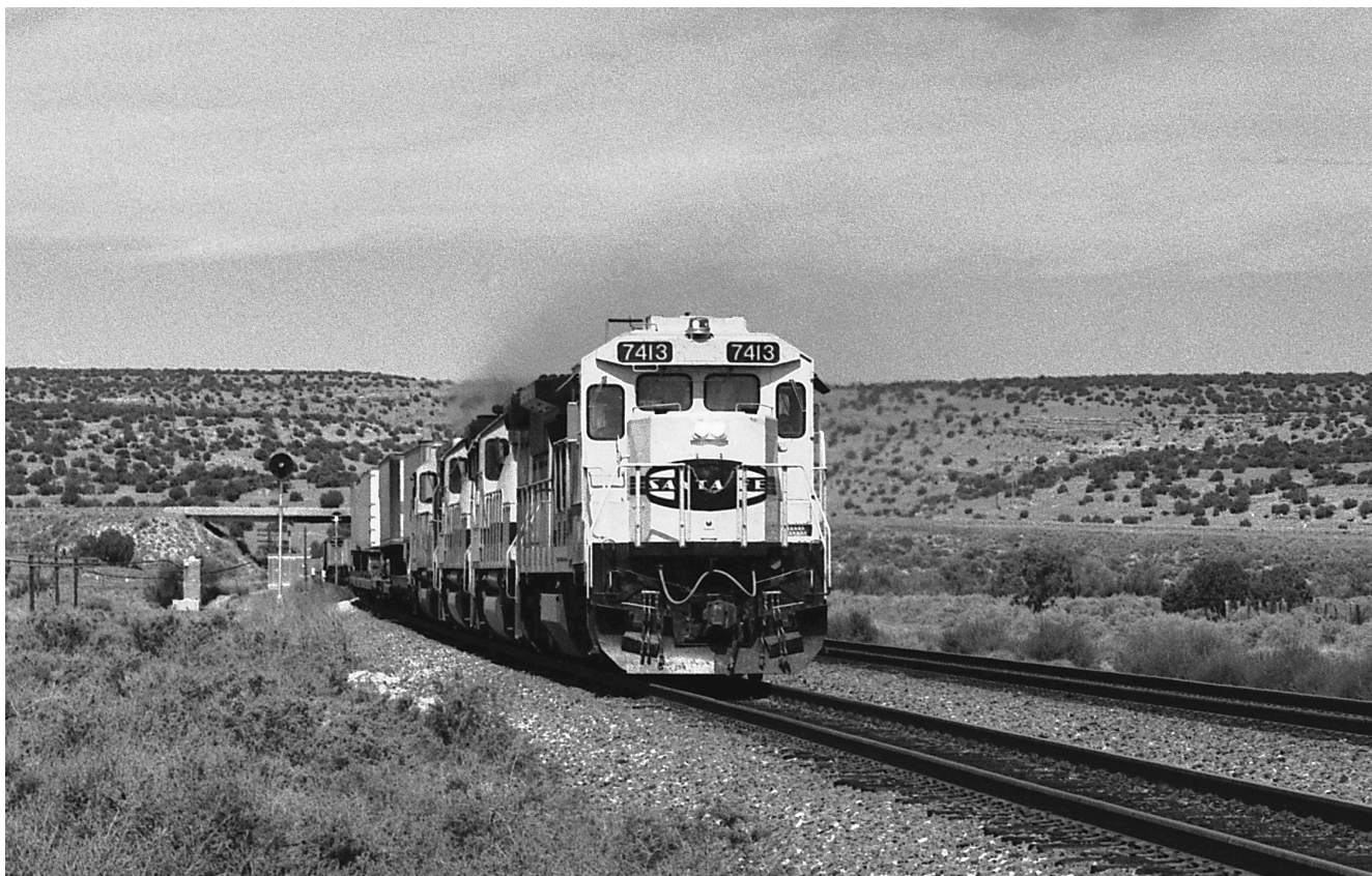
An eastbound at Scholle, New Mexico with a B40-8 and three EMDs enter the double track to Mountainair, 1988.