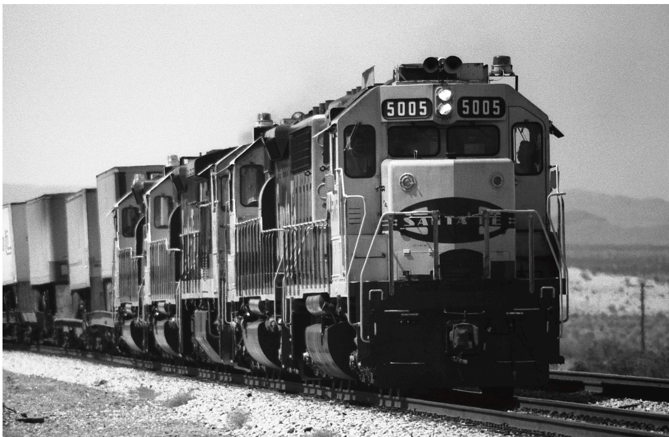
A rebuilt SD40 eastbound between Pisgah and Ludlow on the Needles Subdivision, 1983.